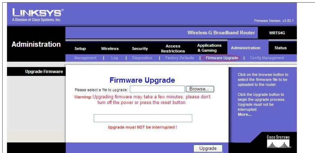
Figure 3: Firmware upgrade window.

Then the browse button is clicked and the firmware file is selected from the host computer and the upgrade button is clicked. The bar in the middle of the page should show the progress of the installation. If it doesn't change within two minutes this means that the installation has not been successful. If this is the case, installation should be carried out via another host machine or another browser. Some browser settings in some browsers prevent the installation of the firmware.