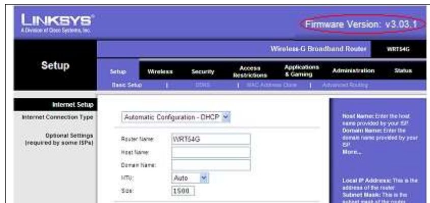
Figure 1: Firmware version specification on the Web Interface.

The original Linksys firmware that ships with each router is generally based on the embedded Linux 2.4.5 Kernel for MIPS processors. However, each hardware version of the WRT54G and WRT54GS models will have firmware versions that are different and their respective updates will also be dependant on the hardware version of the hardware (Linksys, 2005). For example, the firmware version that ships with the hardware version 2.2 of the WRT54G model is version v3.03.1. This can be determined by connecting to the router on one of its four LAN interface connections, then logging into the web interface via a web browser on http://192.168.1.1 . After logging into the web interface, the firmware version should be shown on the top right corner of the screen as seen in Figure 1.