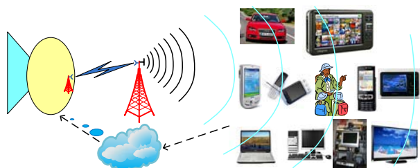
Fig. 1: Digital Terrestrial Broadcasting Outlook

There are a number of options for digital broadcast; however, DVB-T system is the most popular for digital terrestrial television system in the world that has been adopted in more countries than any other [4]. It uses the ETSI 300-744 standard [6] designed for digital terrestrial television services and to some extent mobile receivers [7,8]. To use the existing very high frequency (VHF) and ultra high frequency (UHF) bands effectively, the DVB-T system must operate in three nominal bandwidths at 6 MHz, 7 MHz, and 8 MHz and provide sufficient protection against high levels of co-channel interference (CCI) and adjacent channel interference (ACI) emanating from existing broadcast services. The other standards are Advanced Television Standards Committee (ATSC) of the USA and Integrated Services Digital Broadcasting-Terrestrial (ISDB-T) of Japan.