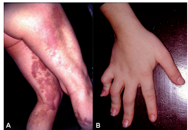
Fig. 2. (A) Hyperpigmentation of the lateral sides of the legs. (B) Distortion of the fingers.