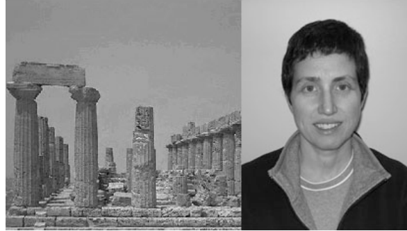
Figure 1. Black and white sample of a face-context pair.

Forty-eight University of Victoria undergraduate