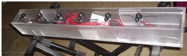
Figure 1. The MLGI interface

We have also experimented with the use of ultrasonic sensors to use in correlation with the photocells, in order to obtain more accurate data for evaluating and processing continuous control messages. Though ultrasonic sensors are more expensive, we recognize the need for accuracy in our data and are currently looking into various ways of implementing them in our design. Details on the design of the MLGI controller are available online 1 .