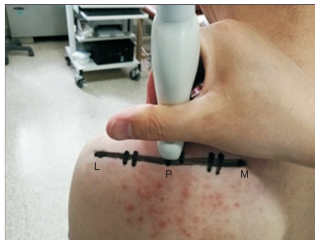
Fig. 1. Measurement location of the supraspinatus muscle cross-sectional area (CSA). The CSA was measured by placing the lateral edge of the probe on P, M, and most medial edge of scapula spine. L, most lateral edge of scapula spine; P, the center of the line connecting M with L.

Values are presented as mean \pm standard deviation or number (%).