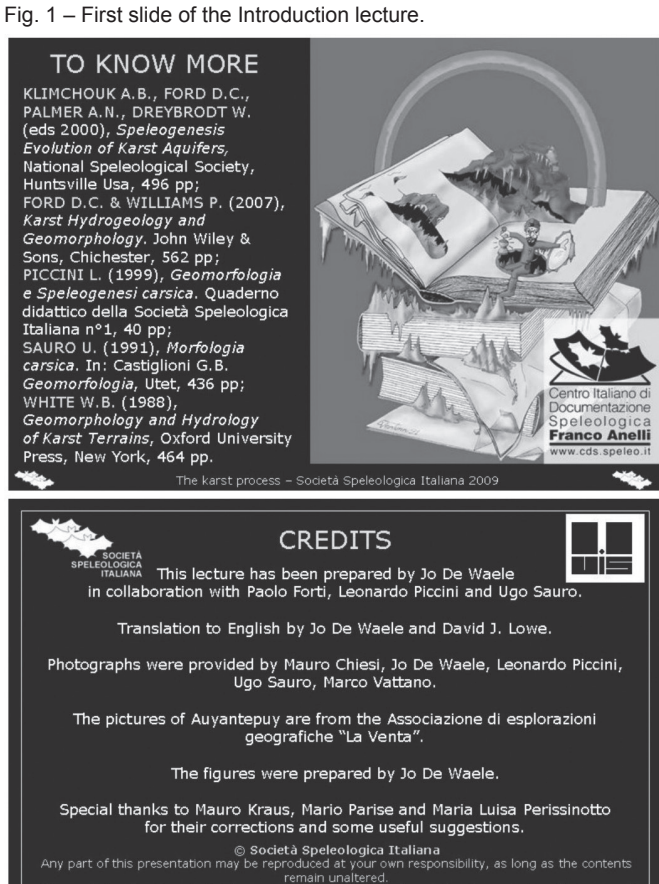
Fig. 2 – References and credits slides (respectively last but one and last slide of each lecture)