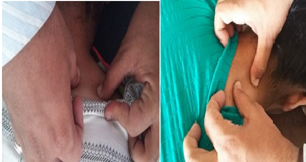
Fig. 1: Showing the Tri Planar Myofascial Release technique.

Group B: Suboccipital Release: In group B subjects (n=15) were instructed to be in supine on the table with the therapist seated at the head of the table. The finger pads should be placed over the suboccipital muscles bilaterally, just inferior to the superior nuchal line down at approximately the level of C2. Traction is then applied with the fingers in an anterior, lateral, and cephalad direction. Therapist then uses two-handed combination moved with greater ease.