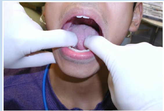
Figure 4. Mandibular examination is performed with palpation in and outside the mouth.