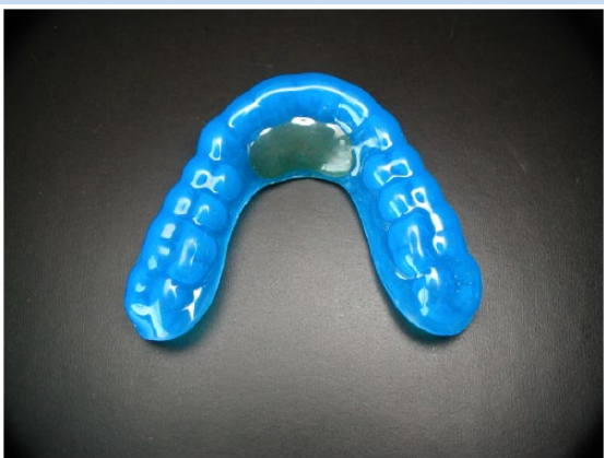
Figure 5. Custom-fitted mouth guard.