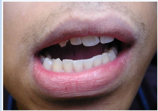
Figure 3. Malocclusion seen in a temporomandibular joint (TMJ) dislocation.