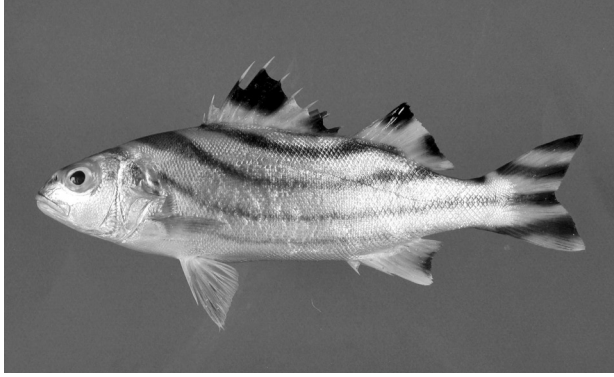
FIG. 1. – Terapon jarbua , 170 mm standard length, from Dor, Mediterranean coast of Israel, HUI 19845.

mm (total length, 213 mm) and a weight of 120.8 g was hooked in very shallow water ( ca. 0.5 m) on the Mediterranean coast of Israel, at Dor (Tantura), ca. 25 km south of Haifa (Fig. 2). The specimen was deposited in the Hebrew University Fish Collection (HUI) and received the catalogue number HUI 19845.