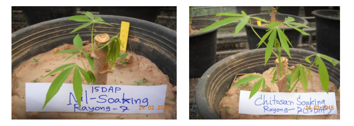
Figure 3. Comparison of soaking stakes (chitosan) and nil-soaking at early growth stage of cassava, greenhouse experiment

The stakes viability can be improved by soaking in chitosan (10 cc diluted in 10 liters of water) for enhancing shoot and root growth at early growth stages (Table 1). This was due to chitosan induced photochemical process of the plant and result in more vigorous growth (Reddy et al., 1999).