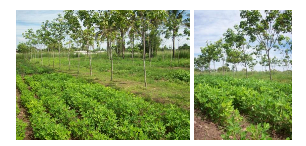
Figure 9. Rubber intercropped with peanut of researcher experiment