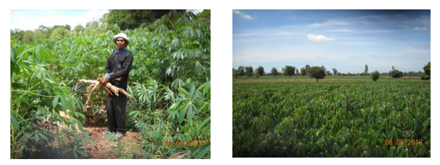
Figure 7. Cassava grown after rice without irrigation in dry season

Mean in the same column with different letters are significantly at P \le 0.05 by LSD. Source: Adapted from Polthanee et al. (2014b)