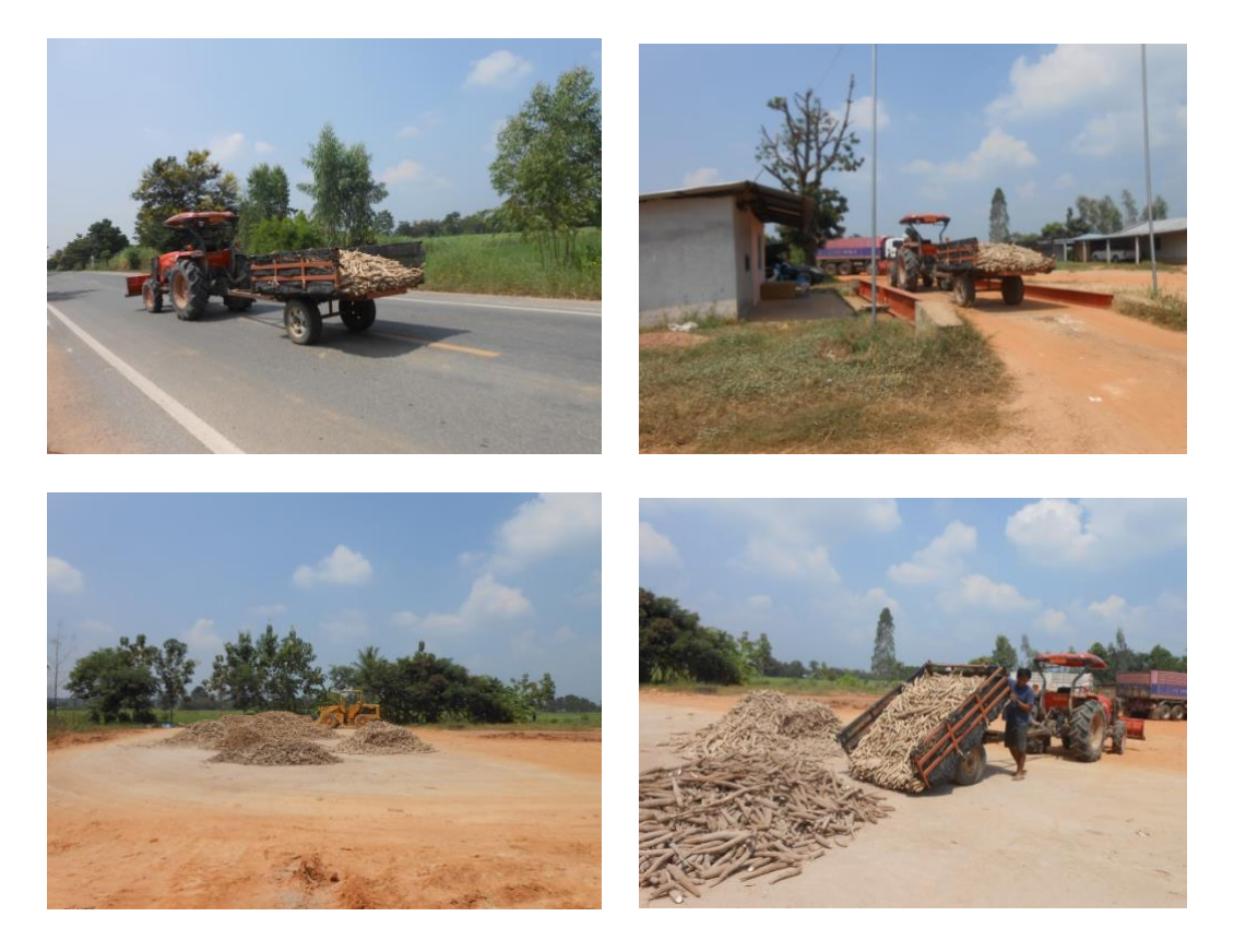
Figure 12. The tuber roots were loaded from farmer's cassava field to merchant for sell