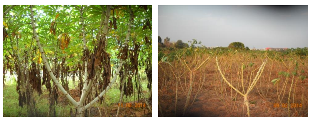
Figure 5. Leaves senescense of cassava during water stress at late growth stage, Northeast Thailand

Table 5. Effects of each irrigation regime and variety on leaf area index and tuber yield of cassava planted in the late rainy season