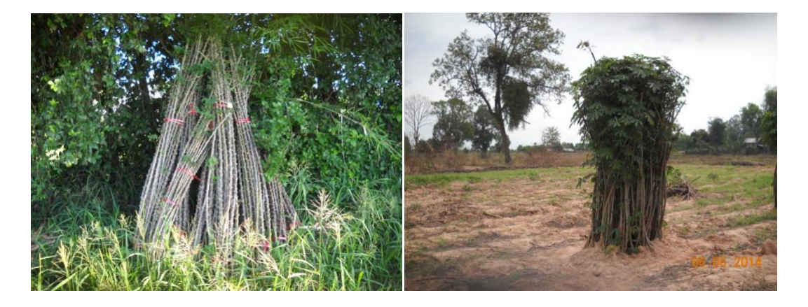
Figure 2. Cuttings of mother stem stored by farmers before planting, Northeast Thailand

stems (15-20 cm) had little effect on germination percentage and sprouting rate. Polthanee (2018) found that stems placed under a tree for 2 months retain stake moisture (50-55%) and still produced high germination percentage (83-100%), depending on cassava cultivars. Furthermore, cassava cutting stems from mother plants stored for 3 months experienced stake moisture reduction of 40-47% at planting and decreased germination percentage (50-67%), depending on cassava cultivars. Due to the capability of stem cuttings from mother plants to store for longer time with little effect on germination percentage, farmers can wait for adequate soil moisture conditions for planting in the event of delays in rainfall conditions in the upcoming season (see Figure 2)".