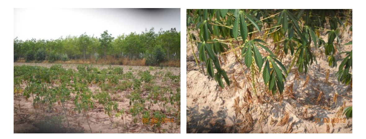
Figure 4. Leaves senescense of cassava during water stress at early growth stage, northeastern Thailand

ns = Not significant, Significantly different at P \le 0.05 (*) and P \le 0.01 (**) Mean in the same column with different letters are significantly at P \le 0.05 by LSD. Source: Adapted from Polthanee and Wongpichet (2017)