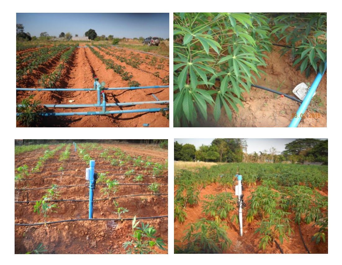
Figure 6. Supplementary by drip irrigation during the dry season

ns = Not significant, Significantly different at P \le 0.05 (*) and P \le 0.01 (**), MAP = Month after planting. Mean in the same column with different letters are significantly at P \le 0.05 by LSD. Sources: Adapted from Polthanee and Srisutham (2018)