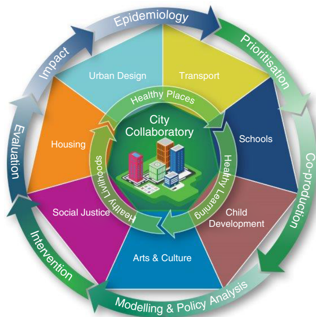
Figure 1. The City Collaboratory model utilises wide interdisciplinary expertise based in three inter-linked themes: Healthy Places, Healthy Learning and Healthy Livelihoods.

We have started our co-production activities, developing, refining and prioritizing the suite of activities outlined in each work