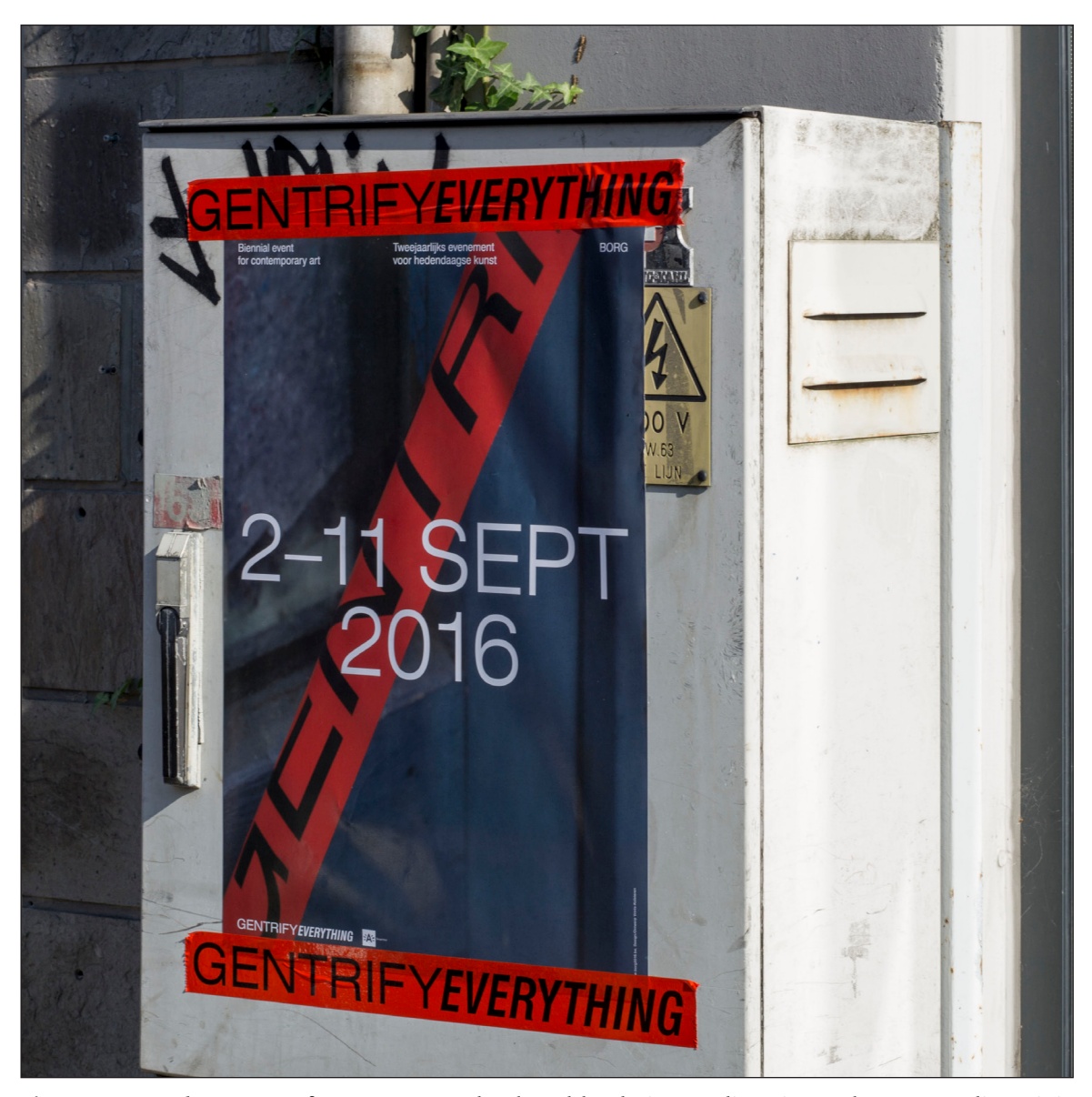
Figure 1: Visual campaign for BORG 2016 , developed by design studio Vrints-Kolsteren.

'the local', then, is based on the false premise that "social relations and identities in a specific context are given and whole, if not holy, that the local audience is a singular group with essential qualities and shared agencies" (Sheikh 73). The lure of the local, Sheikh states, should meet the glamour of the global. Understanding the dialectics between the two, then, is a first step to their deconstruction. If the oxymoronic label 'local biennial' is to mean anything at all, it will have to depend on the way in which the politics of translation take shape on a 'glocal' level. This is also what is at stake with BORG, which is why it is worth expanding on the local context here.