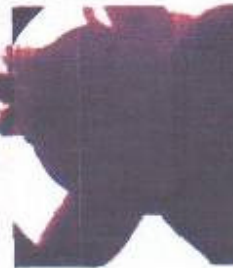
Fig 4 ( Anterior end of fly of chicken ) Pseudolynchia canariensis