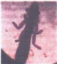
Fig 2 ( Colmbicola columbae )