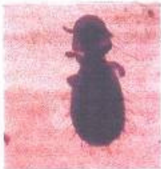
Fig 3 ( Goniocotes gallinae )