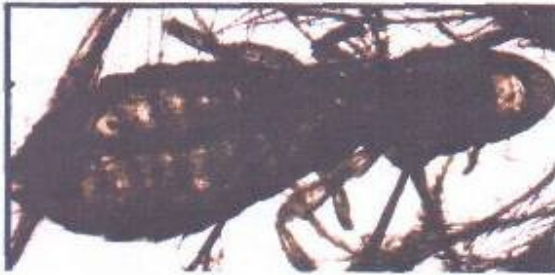
Fig 1 ( Chewing or Biting louse of chicken ) Menacanthus stramineus