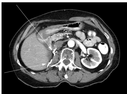
Figure 3 - Abdominal CT scan showing no disease recurrence 6 months after completion of DCA treatment. Arrows show surgical clips in right renal bed post-nephrectomy.

At the time the DCA was stopped, the patient had a triphasic CT scan which showed no evidence of residual cancer. After another 6 months, the patient had a CT scan which again showed no evidence of cancer (Figure 3).