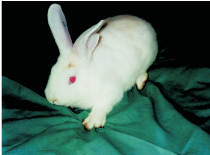
Figure 1. Transgenic rabbit with the human growth hormone gene. Two month old New Zealand male rabbit number 61 of the F0 generation, a founder of the transgenic line. The rabbit was generated following the implantation of a zygote microinjected with the WAP(6xHisThr):hGH gene construct. The founder and his offspring showed no changes in phenotype and behavior.

The screening procedure involving 313 bp and 524 bp PCR products was applied to identify transgenic rabbits. One individual male (number 61) from the F0