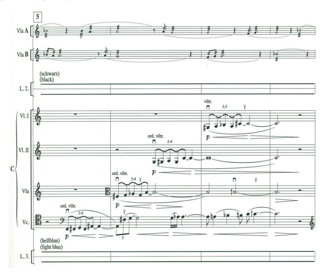
Figure 2 : Technique of point of imitation that begins in cello, viola, violin 2 and violin 1

One other prominent musical feature of past traditions found in this quartet is the frequent use of "point of imitation" in the live performance to create a Renaissance textural sound world. The compositional technique refers to a series of imitative entrances in ordered arrangement. It was commonly found in the sacred music of composers such as Jocab Obrecht and Josquin des Prez during the Renaissance, and even earlier composers such as Lorenzo da Firenze (d. 1372 or 1373) and others. In Gubaidulina's Quartet point of imitation is easily recognizable throughout the music. It is first demonstrated at rehearsal #5 where four parts enter at half measure intervals; nevertheless, it breaks away as the music progresses (Figure 2).