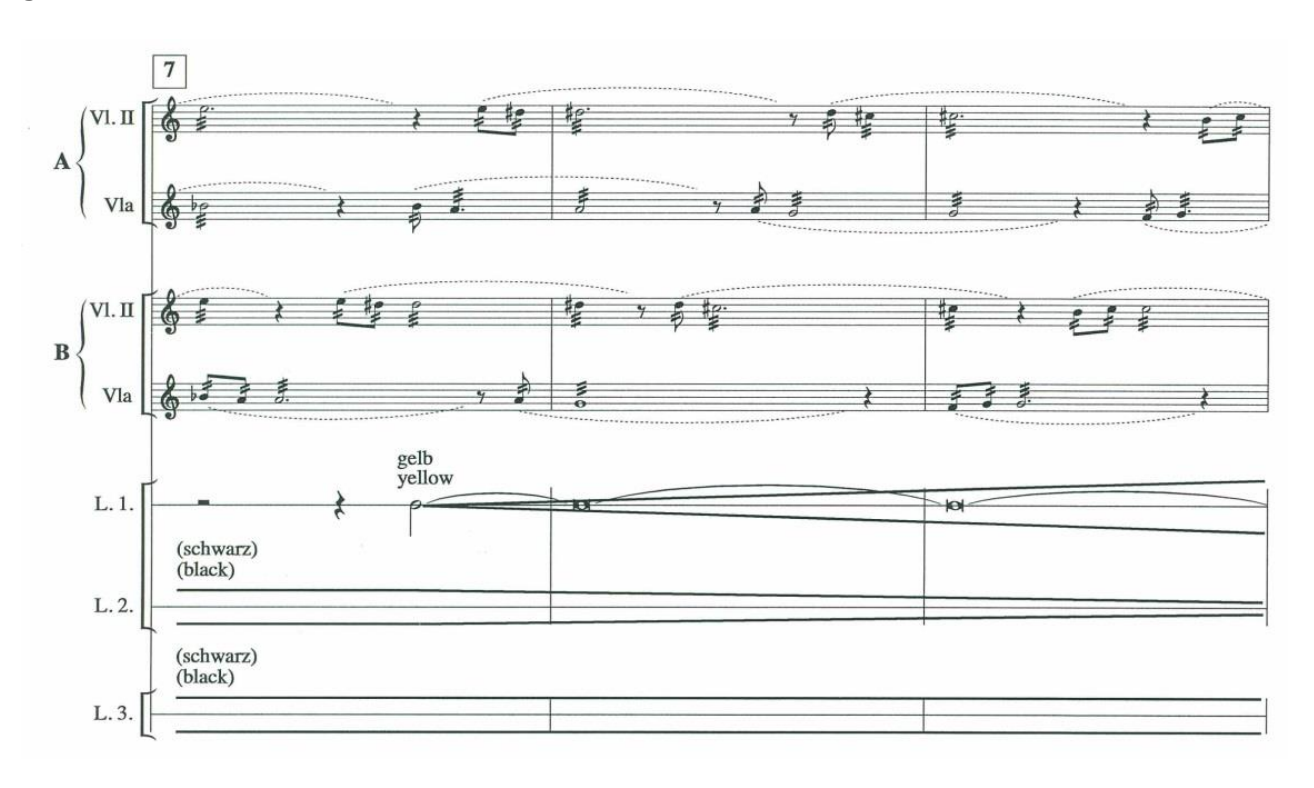
Figure 1: Repeating descending melodic gesture in viola (B flat- A-G-F) and violin II (E-D#-C#-B)

What is interesting here is that Gubaidulina has successfully combined the minimalist technique of repetitive and static texture with the European rootedness tradition of ground bass musical handling, providing an ultimate new synthesis. Throughout the taped sound, the repeated descending melodic gesture in viola (B flat- A-G-F) and violin II (E-D#-C#-B) reminds one of a common musical pattern of baroque basso ostinato or ground bass, that is, descending tetrachord, sometimes called lament bass. Figure 1 illustrates both the melodic gestures of viola and violin II.