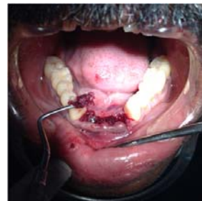
Fig. 6: Placement of bone graft