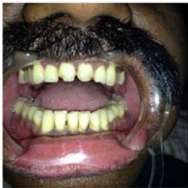
Fig. 3: Pre Operative intra oral