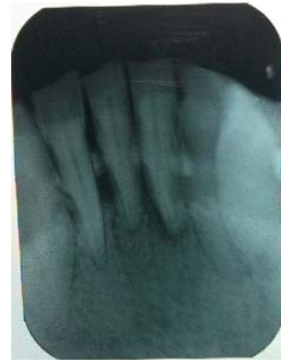
Fig. 2: Pre Operative IOPA