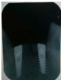
Fig. 7: 3 Months Post Operative

instructions were given, medication was advised. Immediate post-operative radiograph of the implants reveals bone-like mass surrounding the implant. Suture removal was done after a week. Clinical review and radiographical review was done on first month, third month (Fig. 7) and sixth month. Radiographs of each month reveal the bone level around the implants.