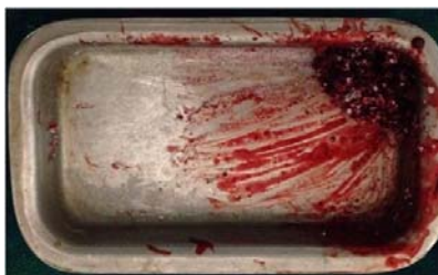
Fig. 5: Nano Hydroxyapatite Bone Graft Mixed with Blood