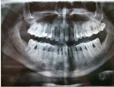
Fig. 1: Pre Operative Radiograph(OPG)

crestal bone level, Inferior alveolar nerve were assessed, sinus level was noted. Atraumatic extraction (fig 4) was done with care in preserving the buccal bone. Lidocaine (2%) with 1:200000 adrenaline would be used as a local anaesthetic solution. Sequential osteotomy of the extracted socket was done with copious saline irrigation drill bits of sizes 2.0, 2.50, 2.80, 3.2, 3.65mm. Implant placement done in prepared socket and primary stability achieved using torque wrench of 40 Ncm, perimplant defect was filled with nano hydroxyapatite bone graft mixed with blood (fig 5,6), cover screw was placed, wound closure was done with black silk. Post operative