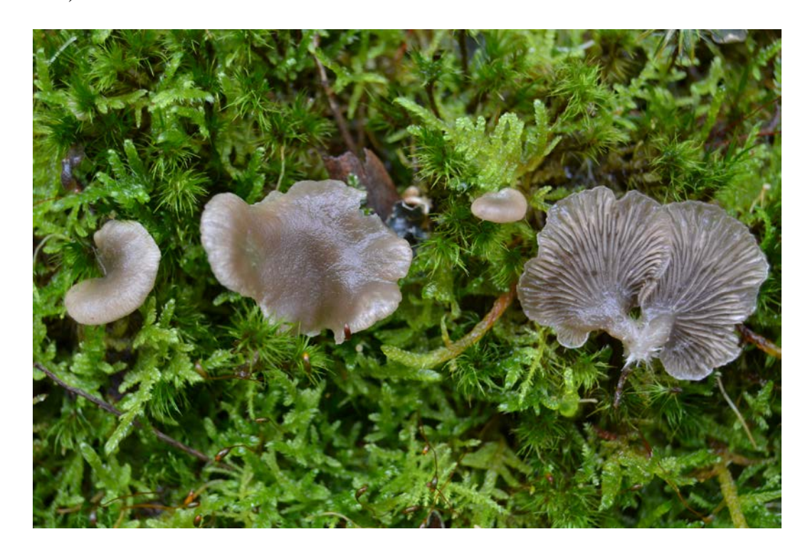
Fig. 3 – Arrhenia subglobisemen (LOU-Fungi 20040).

We have noted the presence of smell strong of raw fish with shades of fresh flour, unusual within the genus Arrhenia (could it be a sign of infection of the basidiomata?) instead of observing the smell of pelargonium mentioned by other authors (Kühner & Lamoure 1972, Elborne 2008, Corriol 2016).