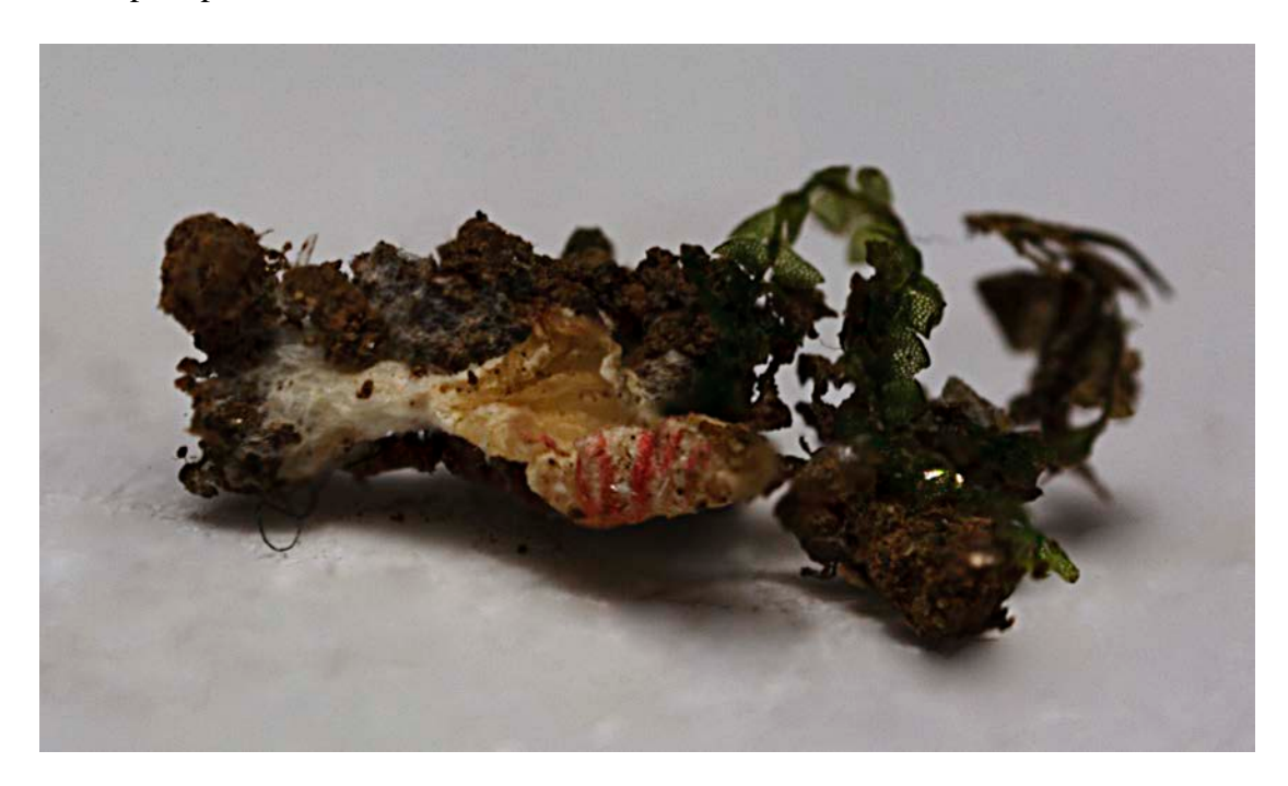
Fig. 1 – Arrhenia pontevedrana (LOU-Fungi 19669, holotype).

the stipe. Context very thin, 0.5 mm thick, whitish, inmutable when exposed. Odor and taste non-distinctive. Spore print whitish.