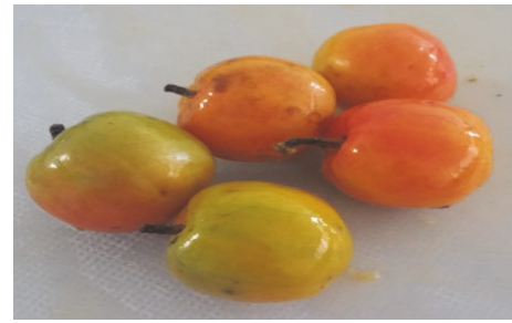
FIGURE 1: Mexican plum ( Spondias purpurea ).

2.2. Ferric Reducing Antioxidant Power (FRAP) Assay. To prepare the FRAP reagent, 2.5 ml of 10 mM tripyridyltriazine dissolved in 40 mM HCL, 2.5 ml of \text{FeCl}_3 , and 25 ml of acetate buffer 0.3 M pH 3.6. The extract was dissolved in phosphate buffer (1 mg / ml). 0.2 ml of the extract solution and 1.8 ml of the fresh FRAP reagent were mixed; then the sample was