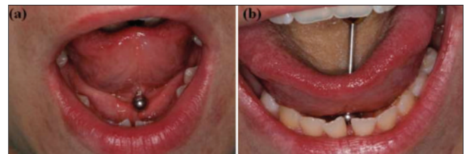
Figure 1 (a,b): (a) Intraoral piercing showing the inferior barbell of the tongue ornament. (b) Inferior component of the piercing in relation to the lingual surface of teeth No. 31 and No. 41.

Individuals seeking oral and peri-oral piercings generally ignore the fact that piercings are usually performed by non-medical professionals, which in turn increases the possibility of infection transfer. 4 In this regard, it is highly recommended that a question regarding the presence or absence of intra-oral piercing/s should be included in the