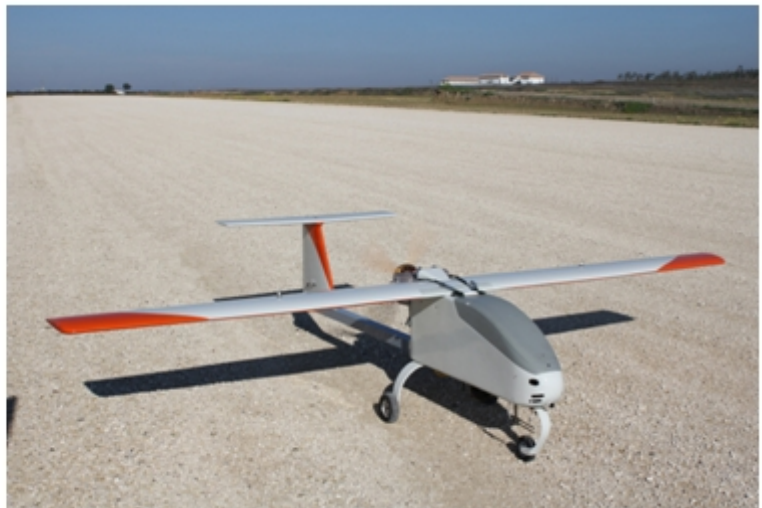
Figure 2 - CATEC's UAVs that will be used for PROSES field experiments