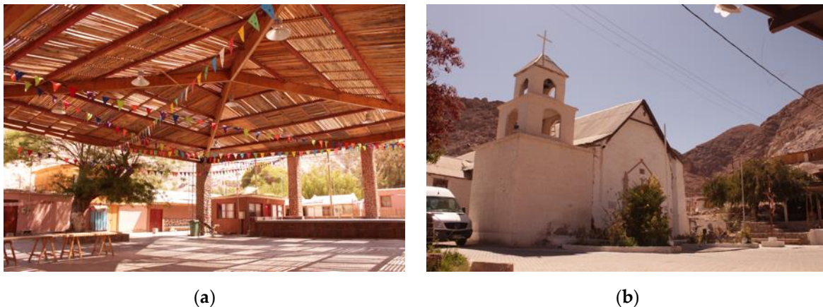
Figure 6. Codpa Town: (a) Square of Codpa; (b) Church of Codpa.

could improve the living conditions of the population. The co-workers have formed many functional and territorial organizations, which meet both in the town and in the city of Arica. Some of them are cultural associations that are oriented to strengthen patrimonial and identity aspects of the town, like for example, the Religious Dance Moreno Mixto Hijos de Codpa, the Social, Cultural and Artistic Club Juventud Estrellas de Codpa, the Agrupación Querido Valle de Codpa or the Agrupación Cultural de Codpa. Others are productive, such as the Cultural Heritage Association of Pintatani Wine Producers of the Codpa Valley, the Indigenous Association of Tourism of the Codpa Valley, or the Indigenous Association of Agricultural Producers of the Commune of Camarones that includes different localities of the valley and the town of Tímar. According to their objectives and functions, these organizations are dedicated to resolving or developing specific issues, bringing together community members who have common interests, acquiring a partial representation concerning the people of Codpa.