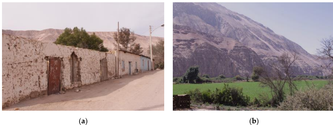
Figure 3. Molinos Town: (a) Some houses; (b) Alfalfa crops.

population of residents in all towns from Molinos to Vilacollo (the last inhabited place) does not exceed 20 people. Despite this depopulation, its current inhabitants still carry out agriculture with traditional canalization, irrigation, and soil management practices. The indigenous communities of this section of the valley are Challallapo Indigenous Community (which incorporates Sora); Chapisca Indigenous Community; Junta de Vecinos and Aguas de Molinos Community; Inti Marka Indigenous Community of Molinos. The most active of these four organizations is the "Junta de Vecinos de Molinos", mainly because more people reside there. Concerning Molinos, the Neighborhood Council and the Indigenous Community are composed of practically the same people, but they meet for different purposes. The former is concerned with aspects related to the village organization, and the latter is oriented towards the application of competitive projects in pursuit of productive benefits.