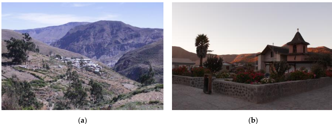
Figure 4. Socoroma Town: (a) View of the town; (b) Square and Church of Socoroma.

Nevertheless, the calendar of religious festivities, very numerous in Socoroma, must be taken into account. Despite internal fissures resulting from rivalries between families, it presents a strong community cohesion, acting based on decisions agreed upon by representative organizations. An emblematic case was the mobilization to end the sanitary landfill in the province of Parinacota, located in Socoroma territory, in the Tojraje sector, a situation that activated the organization of the community, achieving that the authorities stopped the internment of garbage in the landfill. From this perspective, it can be seen that there is a high capacity for management and organization among the “Socoromeños” when common goals or objectives are set.