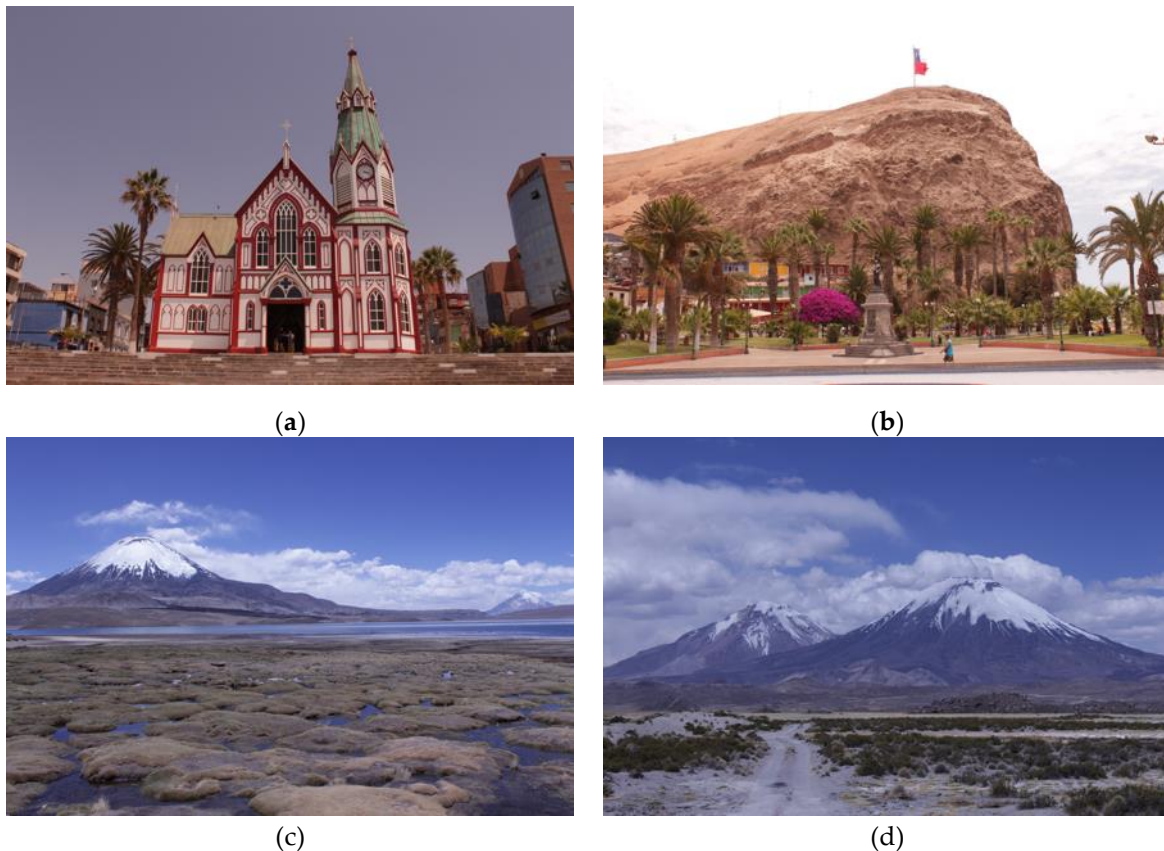
Figure 2. Representative locations in the Region of Arica and Parinacota: (a) “San Marcos” Cathedral, Arica; (b) “El Morro”, Arica; (c) Chungará Lake; and (d) Payachata Mountains.

hydrographic basins, significant from the point of view of biodiversity. Of the hydrographic basins present in the Region of Arica and Parinacota, the only one with an ex-orheic regime and flows into the sea throughout the year is the Lluta River. The Precordilera , which corresponds to the Andes Mountains western slope, between 2,500 and 3,700 meters above sea level, presents an irregular relief of mountain ranges divided by ravines with permanent watercourses due to summer rains and snow melting during the winter. The Altiplano (highlands), also called Puna, corresponds to an extensive plateau of soft reliefs at an average height of 4,000 meters above sea level, whose physiognomy is altered by volcanic elevations that exceed 5,000 and 6,000 meters above sea level. It also has constant sources of water resources by the presence of glaciers and summer rains. The strong thermal oscillation is one of its distinctive characteristics due to its altitude. By virtue of the altitudinal differences, this vertical zoning of the territory promotes large biodiversity in the region, causing specific adaptive systems for the different ecosystems, both from the point of view of natural resources and from the anthropic perspective [5, 6].