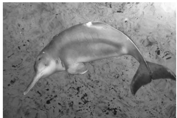
Figure 1. Yangtze River dolphin or baiji ( Lipotes vexillifer ). Male individual ('Qi Qi'), held at the Wuhan dolphinarium from 1980 to 2002.

The baiji is the only recent representative of the Lipotidae, a clade that diverged from other cetacean lineages more than 20 Myr ago (Nikaido et al. 2001). Its extinction represents the loss of a disproportionately large amount of mammalian evolutionary history (Isaac et al. 2007), and only the fourth disappearance of an entire mammal family since AD 1500 (MacPhee & Flemming 1999). It also represents the first documented global extinction of a 'mega-faunal' (greater than 100 kg) vertebrate for over 50 years, since the disappearance of the Caribbean monk seal ( Monachus tropicalis ) in the 1950s (MacPhee & Flemming 1999), and the first such species extinction since the emergence of an international network of