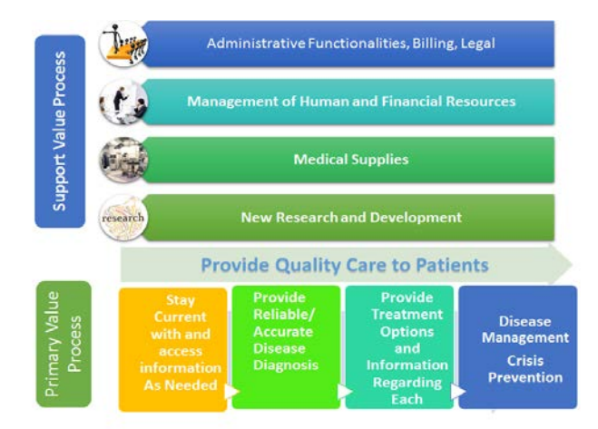
Figure 3: The Value Proposition of E-Health

4.1. Primary Value Processes (PVP) includes the core functionalities of the healthcare sector, i.e., accurate reliable disease diagnosis, provision of appropriate treatment, and prevention of crisis via disease management. The key stakeholders associated with PVPs include the healthcare professionals such as doctors, nurses, laboratory specialists, radiologists etc. and healthcare consumers i.e., patients. Insurance companies also play a critical role in countries where the payment to the healthcare professionals for their services comes from insurance companies. Other parties that could be affected by adaptation of e-heath are next of kin and informal caregivers. (f)