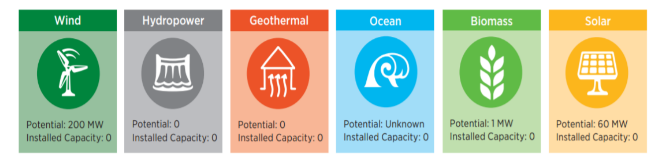
Figure 1. Renewable energy status and potential (adapted from NREL, 2015 [66]).

Ocean renewable energy (ORE) conventionally includes waves, kinetic (tides and currents), ocean thermal energy conversion, and salinity gradients, but can also include offshore wind and solar given their installation in marine environments. ORE is a major component of the blue economy but, excluding a photovoltaic microgrid installed on Ragged Island that has a capacity of 402 kW and other small-scale solar installations, renewable energy in general is limited in The Bahamas, accounting for <0.1% of total electricity generation. In the Bahamas Energy Snapshot prepared by the National Renewable Energy Laboratory (NREL), the status and potential of various sources of renewable energy was collated [66] and is shown graphically in Figure 1. There, the potential of biomass, solar, and wind energy were measured at 1, 60, and 200 MW, respectively, though no details as to how the potentials were calculated and, thus, no independent assessment can be conducted. Crucially in the NREL estimation, wind and solar resources offered the greatest potential for renewable energy development in The Bahamas, but it should be noted that the potential of the ocean was not quantified. Given NREL's defined ORE potential status as "unknown", this represents a significant blind spot and a major hurdle in assessing and exploiting its actual renewable energy resources.