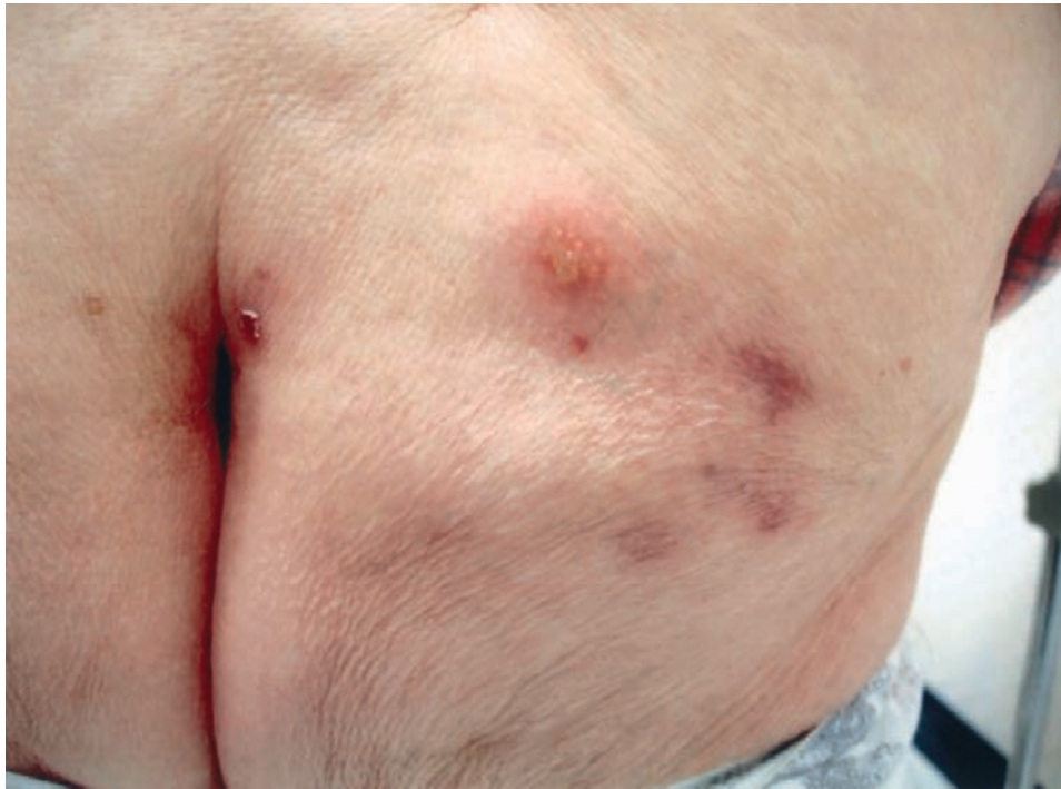
Figure 7. Zosteriform herpes simplex in an elderly woman who presented with what she called “her recurrent shingles.” Vesicles in a lumbosacral distribution had recurred many times over the past several years, and this outbreak began 1 week before the photo was taken. A viral culture demonstrated herpes simplex virus type 2. The patient was otherwise healthy, except for hypertension.

of a similar rash in the same distribution (to rule out recurrent zosteriform herpes simplex; see figure 7); and (6) pain and allodynia in the area of the rash. Allodynia, which is common in both HZ and PHN, is pain evoked by a stimulus that does not normally cause pain—for example, light brushing of the affected area with a cotton swab.