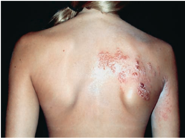
Figure 2. Thoracic herpes zoster

The rash associated with HZ has a brief erythematous and macular phase, which is often missed, after which papules rapidly appear. These papules develop into vesicles within 1–2 days, and vesicles continue to appear for 3–4 days. At this point, lesions of all types may be present (see figures 2–4). The lesions tend to be grouped, and clusters are often seen where there are branches of the cutaneous sensory nerve (e.g., in parasternal, mid-axillary, and paraspinous areas, representing the anterior and lateral branches of the anterior primary division as well as the posterior division of a thoracic nerve). Pustulation of ves-