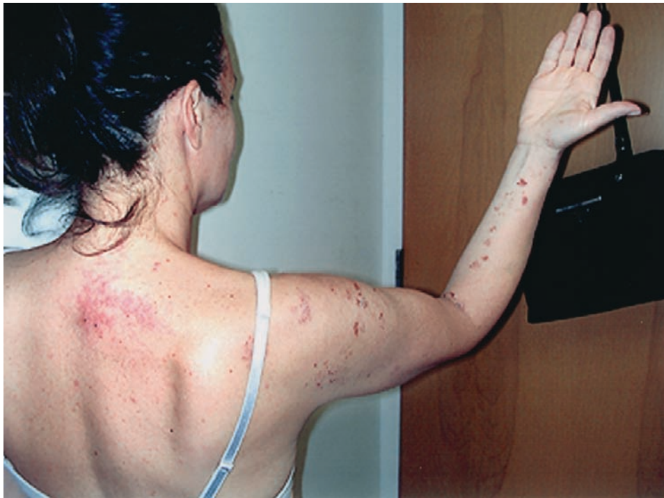
Figure 3. Cervical herpes zoster

In the immunocompetent patient with HZ, there are nu-