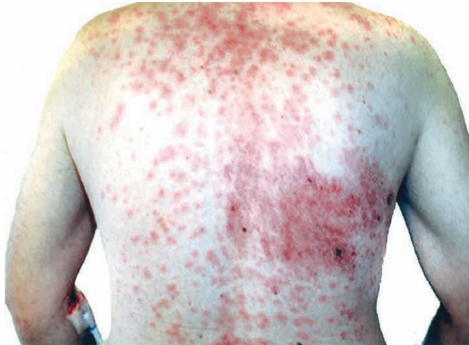
Figure 6. Disseminated herpes zoster

agnoses, and incomplete information about comorbid disease [32–34].