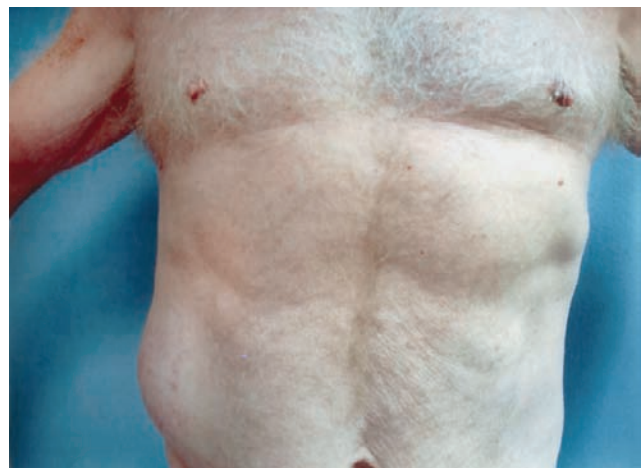
Figure 5. T8 motor neuropathy in an otherwise healthy 59-year-old man who presented with vesicles in the T8 distribution 4 weeks before this photo was taken. The patient was treated with an antiviral agent for 7 days and with analgesics as needed. As the rash resolved, this bulge became apparent; it is consistent with motor damage by varicella-zoster virus to the muscles of the abdomen.

Second cases of HZ are uncommon in immunologically intact hosts, presumably because an episode of HZ will boost immunity and thereby prevent subsequent symptomatic VZV reactivations. The available data suggest that second cases of HZ occur in \leq 5\% of individuals, although this conclusion is limited by the duration of follow-up, uncertainty of the di-