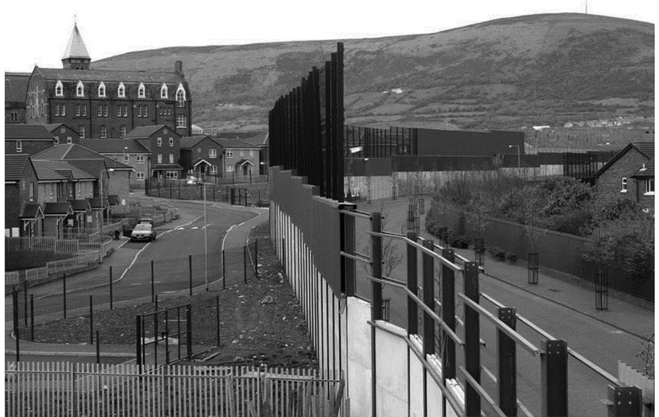
Figure 1 Segregation barrier in West Belfast.

the Middle East and the ‘wall effect’ or reactive depression caused by the Berlin Wall; 17 18 however, no empirical evidence exists regarding the impact these sociopolitical environments have on the health and well-being of the population. Segregated areas lack social cohesion and residential stability with a steeper population decline compared with the rest of Northern Ireland, 19 and have increased levels of violence, which are all deleterious to mental health. 20 Segregation barriers are erected with an aim to reduce conflict and violence and create a sense of protection.