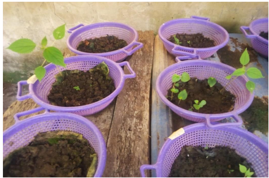
Figure 2. Showing the soil seed emergence.

self- made calibration. The samples were put in polythene bags, labeled. Soil composite were made out of the soil samples collected from the location after thoroughly merged them. The soil seed bank from each location and depth were removed of roots and pebbles and stored in a potting medium of the perforated plastic tray, covered with a cotton cloth to keep the sample moist always (Fig. 2). The sample was taken to the greenhouse at the Department of Forestry and Wood Department's nursery, FUTA where they were incubated to stimulate seed germination. Emerging and readily identifiable seedling was counted, recorded and discarded. Every two weeks, the soil samples were stirred to stimulate seed germination and to encourage seed sprouting during the period of the project. The germinated seedlings were countered and identified. For data analyses, appropriate formulae were involved in basal area computation. Biodiversity indices were adopted to determine species abundance and evenness and to compare community diversity. Descriptive statistics were used to determine the density of trees, shrubs, saplings, seedlings and abundance of soil seed bank distribution.