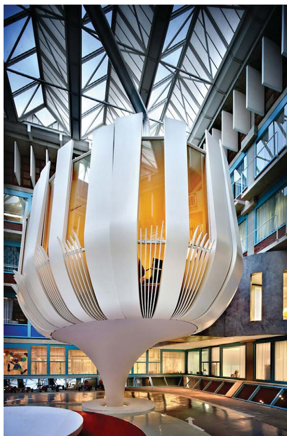
Fig. 1. The Alzheimer center has been designed and built by Leeuwenkamp Architects. The central and most remarkable part of the center is the patient lounge. Standing on a single steel pole, it looks like a lotus flower (or Dutch tulip) that 'envelops' the patients. It offers a safe area that gives comfort. This is where patients come in in the morning and are picked up for their appointments during the entire day. In between appointments, people can read magazines at the round table, chat with their family or fellow patients, or maybe relax a little by looking at the fish tank. Free lunch is served and coffee and tea are available throughout the day. All activities literally take place around the patient lounge, which reflects our motto that the patient is central in everything we do.

The VUmc Alzheimer center is housed in a dedicated unit within the outpatient building of the VUmc since September 2010, when the new facility was opened in the presence of her Majesty the queen of the Netherlands. A large grant of the Innovatiefonds Zorgverzekeraars ( http://www.innovatiefondszorgverzekeraars.nl/ ) has enabled the