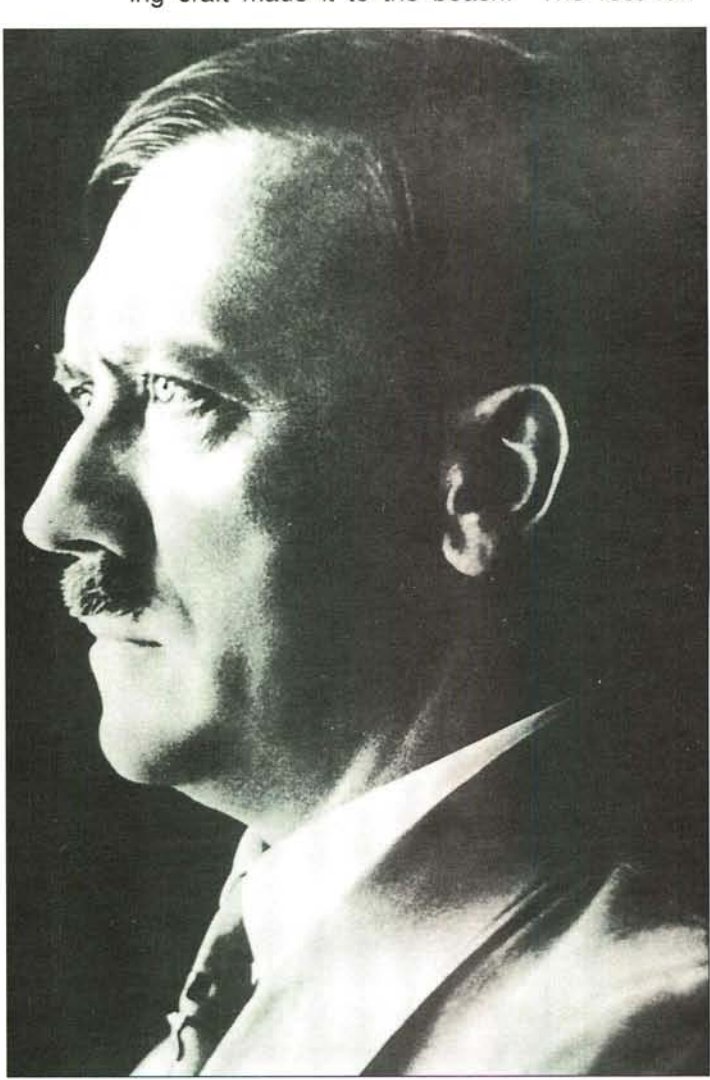
Adolf Hitler was convinced that the Normandy invasion was a decoy and consequently refused to commit more troops to battle in the area.

Neither Rommel nor Hitler, who were both in Bavaria at the time of the invasion, were informed of the Allied arrival until after 10h00 that morning. Rommel only reached Normandy later that night with strict instructions from Hitler to drive the Allies back into the sea before midnight. Although hard fighting on each of the three beaches chosen for the British and Canadian forces ensued they made steady progress inland with the aid of specially designed armoured vehicles. The easiest landings occurred on Utah beach where navigational errors concentrated the landings in areas which happened to be lightly defended. The other American beach - Omaha - was in complete contrast. Here only two of the original 32 landing craft made it to the beach. The rest ran