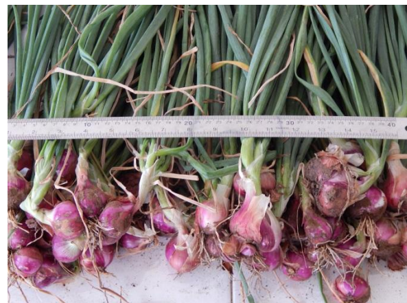
Figure 5 – Bulbs of shallot harvested from the experimental site during the growing season in 2019

Plant Height and Number of Leaves. Parameter of plant height was measured in cm from the soil surface to the tip of the highest leaf as many as 7 plants in each experimental plot at the age of 20 and 70 DAS. Based on the results of ANOVA analysis, treatment B4