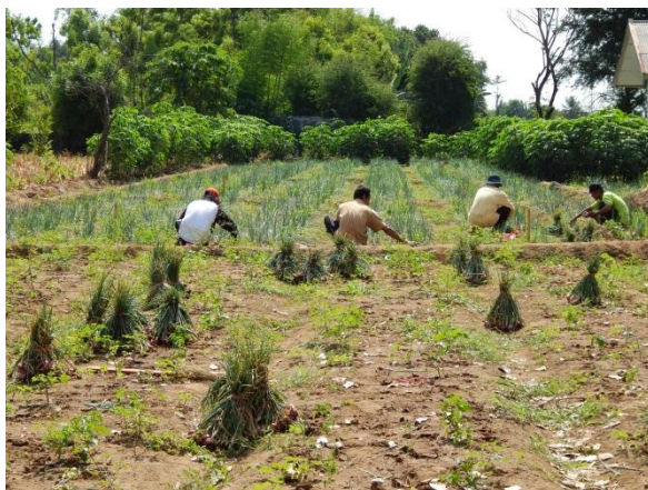
Figure 4 – Harvesting activities of shallot in the experimental site 70 days after sowing