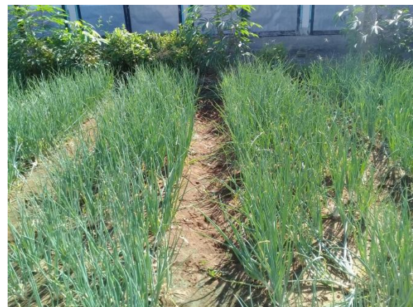
Figure 3 – Growth performance of shallot in the experimental site during the growing season in 2019