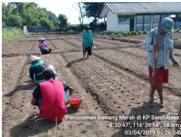
Figure 2 – Shallot sowing activities in the experimental site on 3 rd April 2019

Cation Exchange Capacity (CEC) at the experimental site is low with a value of 16.26 cmol/kg but still above the average CEC for sandy soils, which is generally 2-4 cmol/kg (Ashari, 1995). Factors that can increase CEC are based on the amount of clay and organic matter (Darlita et al. , 2017). The very low C-organic content of the soil affects the CEC value of the soil. Sulastri (2006) stated that CEC in general can provide an overview of the amount of soil cations in available form that can be utilized by plants.