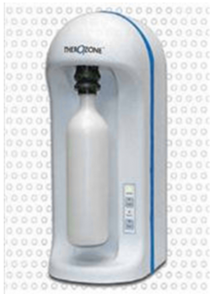
Figure 3: TherOzone Unit