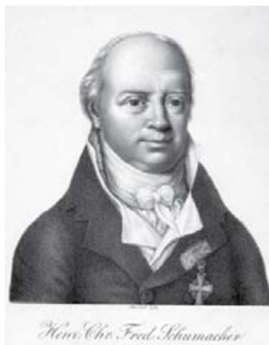
Fig. 2. (Heinrich) Christian Friedrich Schumacher (1757–1830), surgeon and botanist in Copenhagen, Denmark, with whom Fries exchanged botanical ideas.