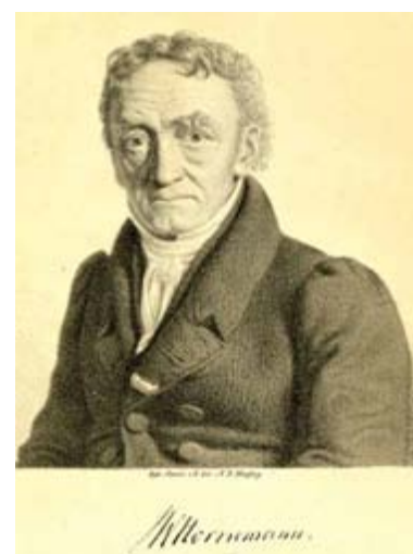
Fig. 3. Jens Wilken Hornemann (1770–1841), Danish botanist, editor of Flora Danica and collaborator with Fries.

and again in 1877 (Fries 1877; again in Latin), and again in 1955 (Fries & Fries 1955; in English, as part of the 50-year celebration of the Danish Mycological Society). Numerous sketches and portraits of Fries have been executed (Fig. 1). 2