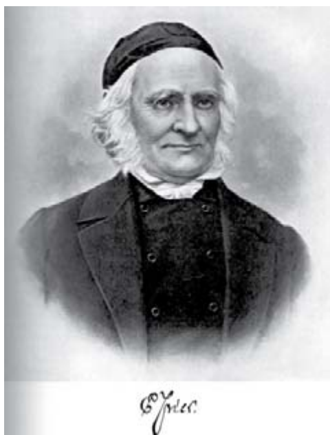
Fig. 5. Elias Magnus Fries. Signed image, probably 1876, two years before Fries's death.

usually full-size color illustrations of many species he knew, numerous students and especially their dissertations, two exsiccatae, wide personal correspondence and, perhaps best of all, intimate interaction with at least two succeeding individuals of mycological inclination, Hampus von Post and Lars Romell.