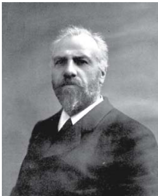
Fig. 12. Lars Romell (1854–1927), collaborator of Elias Fries and perpetuator of the Fries legacy.

on a “starting point” for the nomenclature of fungi, mycologists at the Congress put forward a proposal to “start nomenclature” of most fungi with Fries’s Systema Mycologicum , volume 1, the date of which was accepted as 1821 (Petersen 1977). No mention was made of volumes 2 and 3, nor of the Elenchus 1 or 2 (eventually to be included, and legislatively dated as 1 January 1821). To be sure, no separation was made between taxonomy and nomenclature: Fries’s adoption of names was not distinct from his concepts of definable taxa. This was a distinction which was debated later. Fries’s Observationes Mycologicae (Fries 1815, 1818) was not included in the “starting point” literature, and Persoon’s Synopsis Methodica Fungorum (Persoon 1801) was designated as starting point for nomenclature of certain selected fungal groups.