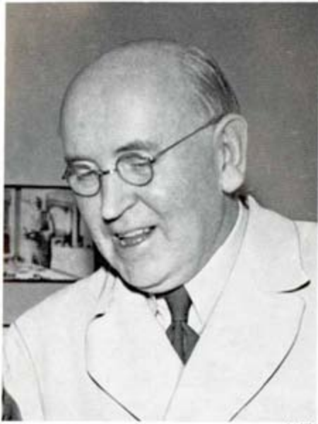
Fig. 13. Seth Lundell (1892–1966), founder of Fungi Exsiccati Suecici .