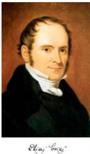
Fig. 1. Elias Magnus Fries. A portrait reproduced numerous times but thought by the Fries family to have a good likeness.