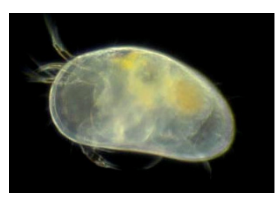
Figure 1 Freshly hatched larva (150–200 \mu m) of the ostracod crustacean Heterocypris incongruens.

Organisms are collected 52 h after the start of the incubation of the cysts in standard freshwater at 25 °C under continuous illumination. Neonates are pre-fed with Spirulina micro-algae for 4 h prior to their transfer to the cups which are filled with 300 \mu L sediment and 2 mL overlying (standard) freshwater containing a suspension of live algae (3 × 10<sup>7</sup> cells).