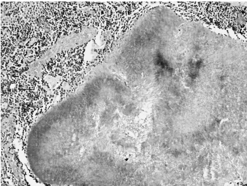
Fig. 2: „Sulfur granule“: aggregates of basophilic, filamentous Actinomyces is located within tonsillar crypt (H&E, x 200 magnification).