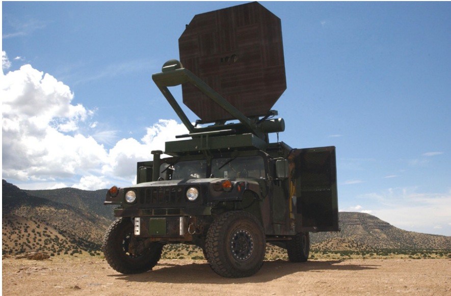
Figure 3. ADS Technology Demonstrator Components