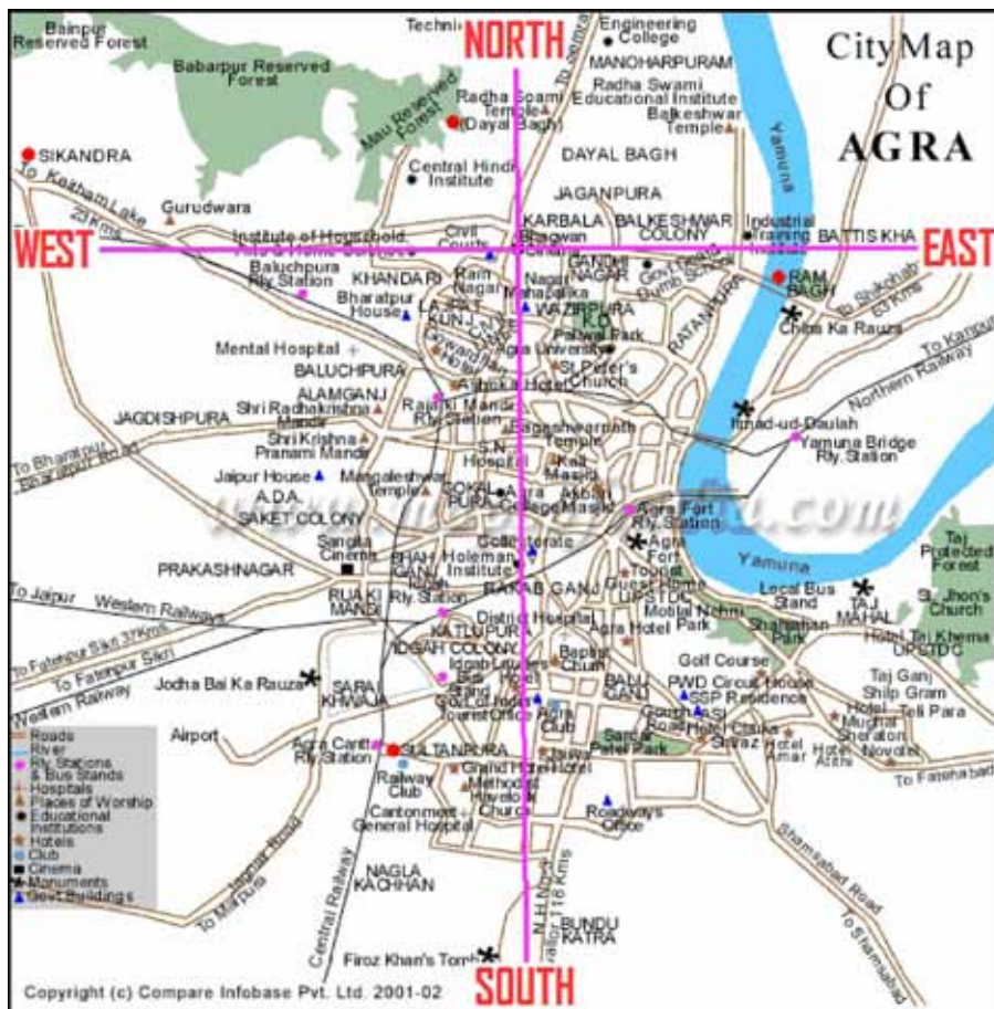
Figure 1: Map of Agra showing different sites of sampling. Slika 1: Zemljevid z mesti vzorčenja.

Data analysis showed that S.aureus contamination was higher in samples of cow milk, cottage cheese and khoa sweets collected from the eastern part (Ram Bagh) of Agra city. Buffalo milk samples collected from the in western part (Sikandra) of Agra city showed a higher contamination. Khoa and cottage cheese samples from