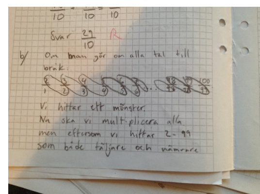
Figure 1 Task 1