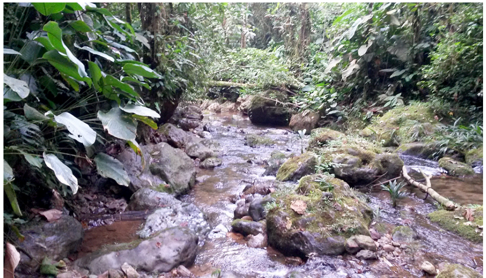
FIGURE 9 | Quebrada Sune, tributary of Pachijal River, Pichincha. Type locality of Microglanis berbixae .