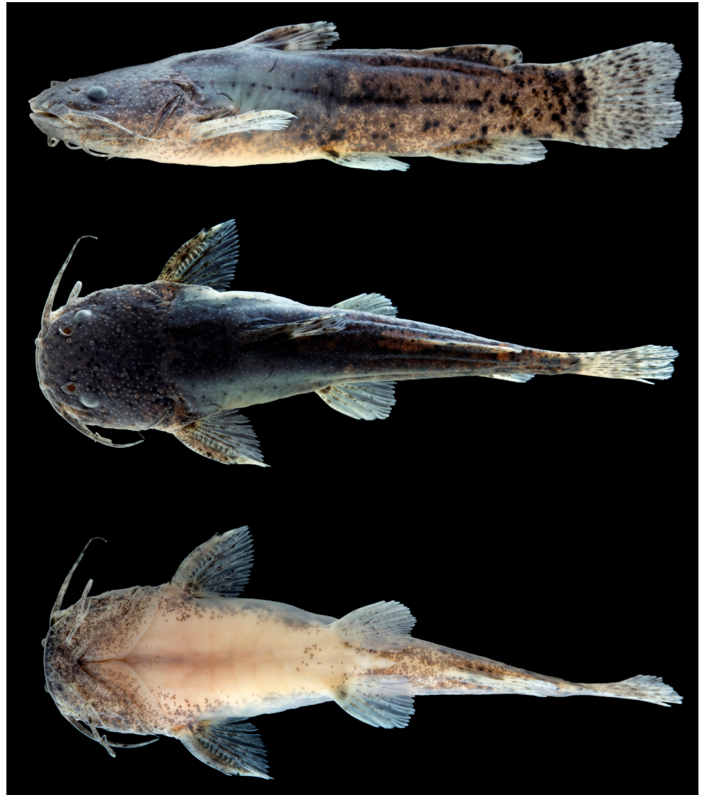
FIGURE 2 | Microglanis variegatus , MECN-DP 4259, male, 37.9 mm SL.-

flat or slightly convex until anal-fin origin, and then slightly concave posteriorly (Fig. 1). Anus and urogenital papilla are differentiable. Papilla located behind the anus as a thickened fleshy tube, with variable shape between sexes (see “Sexual dimorphism” section).