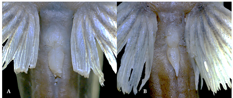
FIGURE 7 | Microglanis berbixae , close up urogenital papillae. A. Female, MECN-DP-3765, 53.5 mm SL. B. Male, MECN-DP-3765, 52.6 mm SL.

At the Mashpi River, specimens were captured from the mouth of a small stream draining to the main channel, at 562 masl. Pphysicochemical variables were: water temperature of 23.2°C, a conductivity of 78.7 \mu S cm -1 , dissolved oxygen with a saturation of 89.4%, and a pH of 7.8. River stretch with a mean width of 1.9 m and a mean depth of 13.1 cm, mainly dominated by shallow rapids with slow velocities ( < 0.3 m s -1 ). Substrate composed by: sand ( < 2 mm) 55%; gravel (2–64 mm) 13%; pebbles