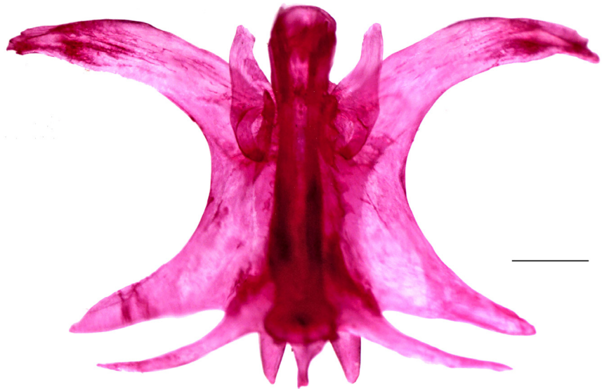
FIGURE 5 | Microglanis berbixae , MECN-DP 3762, paratype, 39.6 mm SL. Ventral view Weberian apparatus. Scale bar = 1 mm.