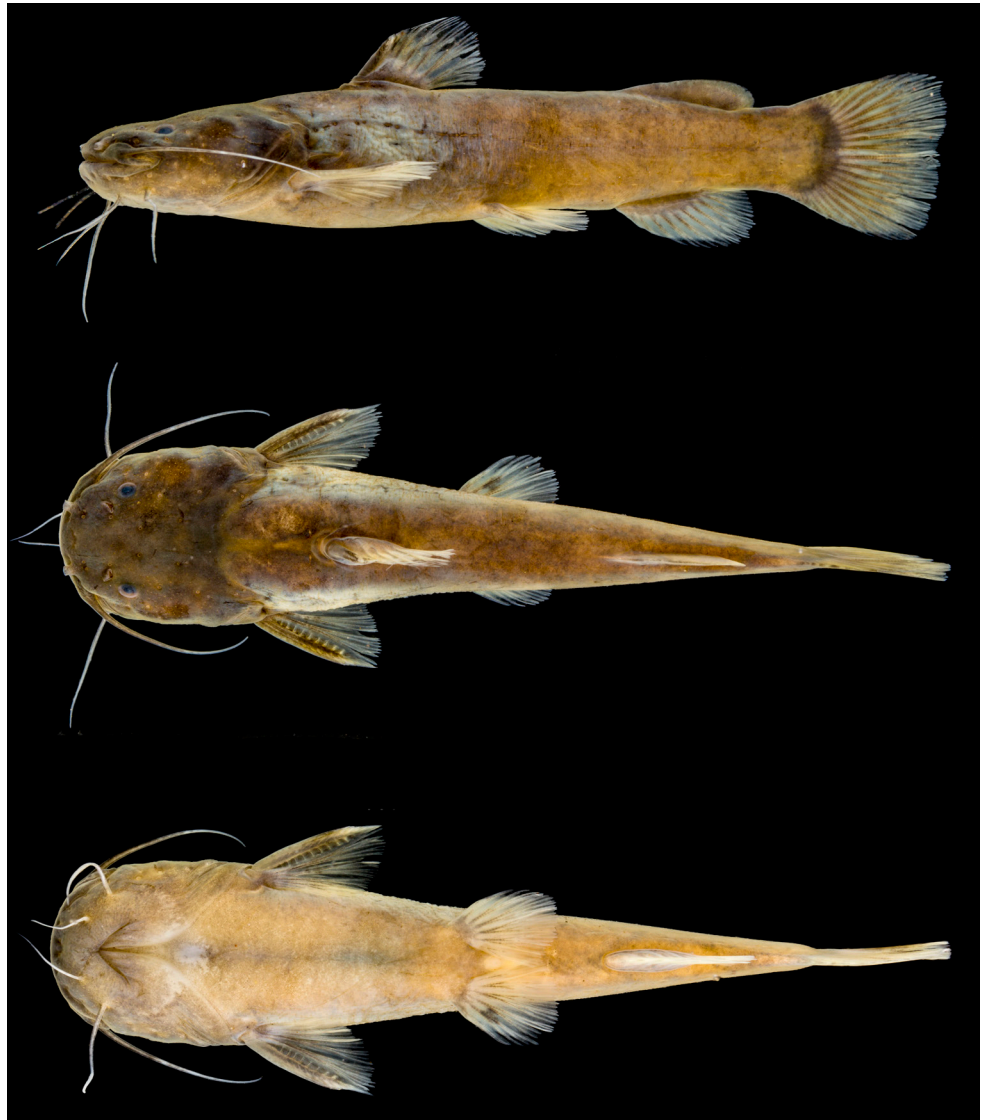
FIGURE 1 | Microglanis berbixae new species, MECN-DP-3944, holotype, male 54.2 mm SL.

origin and anterior area are normal, while in M. variegatus , these areas are notably lighter or luminous (Figs. 1–3). Specimens of M. berbixae may have two or three black spots on adipose-fin, not observed in specimens of M. variegatus . Additionally, M. berbixae have higher values of distance between dorsal and pelvic fins than M. variegatus (24.4%–28.8% SL and 22.0%–24.1% SL, respectively) and between posterior nostrils (40.5%–52.3% HL and 24.4%–30.6% HL, respectively).