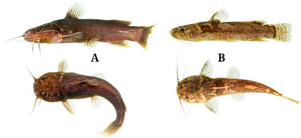
FIGURE 3 | Color pattern in live specimens. A. Microglanis berbixae , MECN-DP-3764, 48.4 mm SL. B. Microglanis variegatus , MZUTI-P-000626, 35.66 mm SL.

surpassing pectoral-fin base. Outer mental barbel not reaching pectoral-fin base; inner mental barbel shorter, reaching almost half-length of outer mental barbel (Fig. 1).