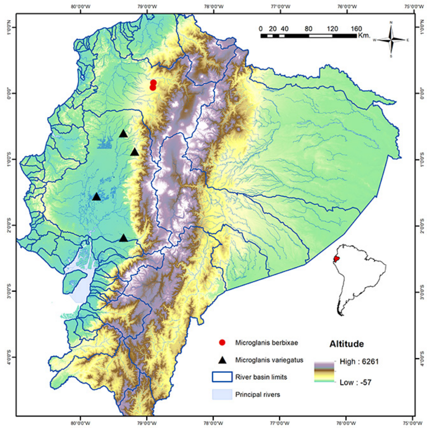
FIGURE 8 | Map of Ecuador showing capture localities of Microglanis berbixae (red dots) and Microglanis variegatus (black triangles).