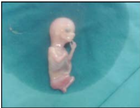
Figure 1 - The fetus of the omental pregnancy. The photograph was taken immediately after the removal of the fetus from the uterovesical fold by detaching it from the placenta. The fetus development is consistent with 12 weeks of gestation.

The fetus was approximately 12 weeks old according to its development (Figure 1). Histological evidence of neovascularization into the supporting tissue confirmed our diagnosis of primary omental pregnancy (Figure 2). The right ovarian cyst excised was a hemorrhagic corpus luteum cyst. The uterine curettage yielded a decidual endometrial reaction. The patient was discharged on postoperative day 4 without any complication. The patient's consent was obtained for publication of this case report.