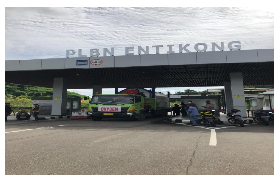
Figure 4. Officer check the oxygen tanks that arrived at the border gate

After the lift truck with oxygen tank is ready for transport, the truck is accompanied on the way by a police car and some vehicles behind it. Also, field officers are prepared at