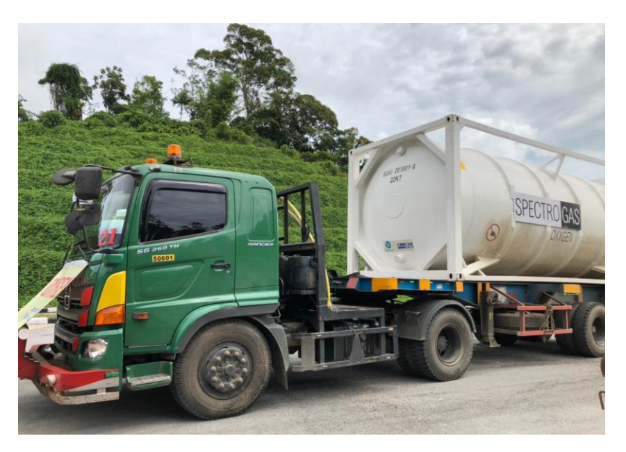
Figure 3. Oxygen Tanker Arrival at Entikong Border

Some activity was carry out start from double checking the oxygen tanks when arrival at Entikong Border and border gate before sending the oxygen tanks to Pontianak uder strict supervision by the security forces consisting of the police, immigration staffs, and the PLBN staffs and passes several guard posts to ensure the process went well and the oxygen tanks supply arrived in Pontianak safely. The import of oxygen tanks was initiated by the Governor of West Kalimantan for the emergency situation and increased the number of patients affected by the covid-19 viruses. After initiating meetings and collaborating with many sectors in the border area, there were three activities related to the sending of oxygen tanks that area passed as a mitigation process against covid-19 pandemic as mentioned above. Starting by checking the oxygen tanks when arrival at Entikong Border and border gate by the immigration staffs and PLBN staffs before sending the oxygen tanks to Pontianak like the activity in the following figure 3 and figure 4.