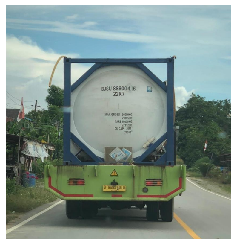
Figure 5. Oxygen tanker on its way to Pontianak

certain points along the road to review the condition of the oxygen tank truck during the documentation process figure 5.