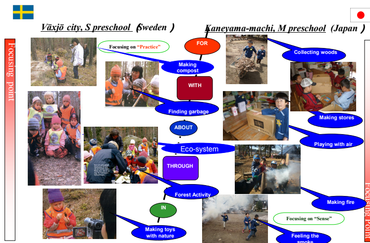
Figure 2. Comparison of ESD at preschool by field study.