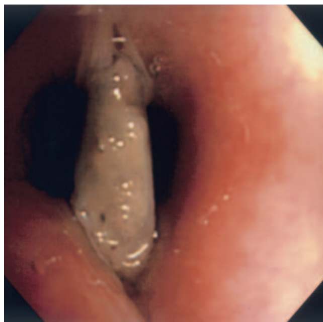
Figure 2. Fiberoptic bronchoscopy showing a foreign body covered with mucus in the left main bronchus.

A 55-year-old woman on maintenance hemodialysis presented with a recurrent cough, hemoptysis and productive purulent sputum. She had undergone a tracheoplasty with her own rib for stenosis of the trachea six years earlier. A chest radiograph showed infiltrative shadows in the left lung field. A computed tomographic (CT) scan of the chest showed a stick-like structure in the left main bronchus, and consolidation of the left lower lobe (Fig. 1). Fiberoptic bronchoscopy disclosed a foreign body covered with mucus