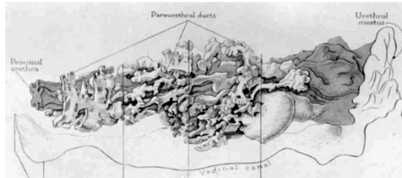
Figure 1 Huffman's wax model of the female prostate, longitudinal aspect [49].

their view was not held by other scientists. In 1982, Addiego and colleagues were the first to analyze ejaculate from a woman and found a significant chemical dissimilarity (prostatic acid phosphatase, urea and creatinine) between urine and ejaculate [45]. Several additional studies confirmed this phenomenon [46,47], reporting that components found in the ejaculate were similar and comparable with male ejaculate [47–49]. Current research strongly indicates that the paraurethral ducts described by Skene are in fact the female prostate as proposed by de Graaf [48,50]. During the last 30 years the most profound and extensive research on the female prostate has been conducted by Zaviacic and his group providing significant anatomical, histopathological, and functional insights. They showed the differences between the male and female prostate, as they described the prostate of females being significantly smaller than the male prostate and lying within the wall of the urethra, while the male prostate surrounds the