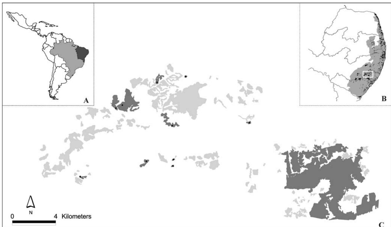
Figure 1. Study landscape at the Atlantic forest of northeast Brazil. (A) Northeastern Brazil, where this study was conducted. (B) Distribution of the Atlantic forest of northeast Brazil (= Pernambuco Center of Endemism), note original (grey) and current (black) distribution of this forest in the region; white rectangle represents the study landscape (amplified in C). (C) Study landscape with the fragments used in this study (dark grey polygons), including the 3,500 ha Coimbra forest (lower right). Light grey and white areas represent remaining forest fragments (not sampled) and sugar-cane cultivation, respectively.

Our study landscape consists of a low-altitude plateau (300–400 m above sea level) containing two similar classes of dystrophic soils with high clay fractions: yellow-red latosols and yellow-red podzols (according to the Brazilian soil classification system [36]). Annual rainfall is ~2000 mm, with a 3-month dry season (<60 mm/month) from November to January. Forests in this