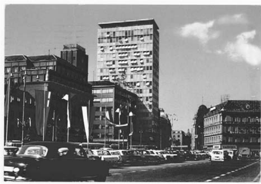
figure 7: Postcard with Ilica Skyscraper (S. Jovicic, S. Hital, I. Zuljevic, 1959) at night

the lights of the metropolis with associations of its New York forerunner. It is its location that is focal; aluminum glass construction, the most modern building in communist Zagreb, located in the very heart of the nineteenth-century fairground. Shining in the daylight, reflecting the sun, and artificially lit at night, the Ilica Skyscraper, like every other skyscraper, was a visual focal point and simultaneously a symbol of the modernity of Zagreb architecture and interpolation. This is why it entered the city's iconography; in addition to modernity it also embraced the content of tradition.