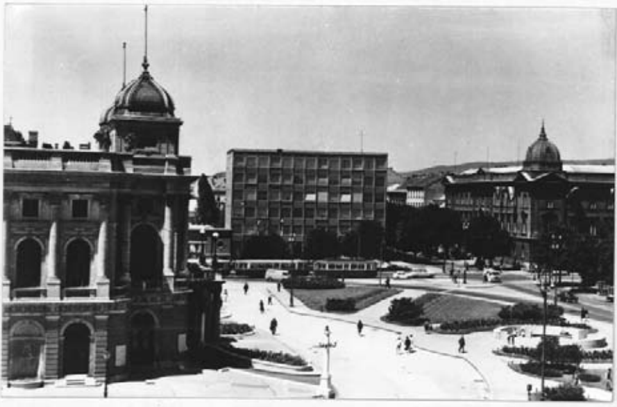
figure 6: Postcard with Zeljph Building (S. Fabris, 1964) in the middle, National Theater on the left and Lexicographic Institute on the right

ons demanded suspension of the construction and announced new bidding for the new structure (Vukadin, 2007, 231). That demand was refused, and the building was finished considerably differently from Fabris' project, and discussions about its quality and its integration within the environment did not abate until the announcement of the new bidding in 1990 for a redesign of the Music Academy.