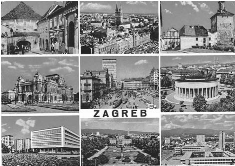
figure 5: Postcard with motives of Zagreb – from left to right: the Stone Gate, the Cathedral, Lortscak Tower, National Theater, Ilica Skyscraper, Museum of the Revolution, the City Hall, Art’s pavilion, University Allee

New Zagreb, burdened by economizing the production costs of the dwelling units, encouraged experimentation with new construction methods and techniques. The Jugomont Company manufactured the JU 61 system, which consisted of prefabricated concrete construction and replaceable aluminum skins. Construction was significantly accelerated, standardized, and flexible (Blau, Rupnik, 2007 260), and thus cheap. The apartments were popularly referred to as “cans” and were conceived of as “dwelling machines” appropriate for their inhabitants: industrial workers.