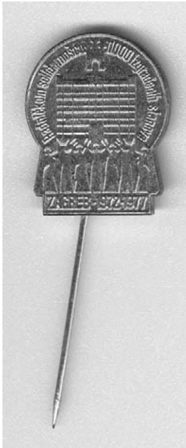
figure 1: Pin with the sign 'With workers' solidarity 1000 new apartments'

The working class became a legitimizing basis under the new system, and so this agricultural country was tasked with creating, in a short period of time, the necessary conditions for rise of this new dominant social class. By 1900 (i.e., by the time Croatia had achieved a degree of autonomy), Zagreb had assumed integrating characteristics: accelerated spatial, population, industrial, and transport growth; establishment as the regional and political center; and a place that attracted new immigrants. This partially resulted from the natural processes of urban growth, but mostly from the articulation of new sociopolitical relations.