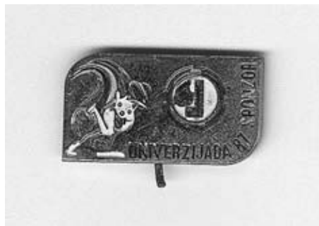
figure 9: Pin with motif of Zagi

To promote this huge sports event, in addition to designing the mascot Zagi, which was disseminated in all possible media from toys and pins to facades and flags, very intensive promotion was organized for every new structure built for this occasion. These automatically gained symbolic meaning and assumed iconic status. Numerous postcards with the Cibona Tower and the Dubrovnik Hotel were printed; pins were made with the figure of Zagi, the Volleyball Club, and so on. The Universiade became a very powerful symbol of Zagreb, and all the structures and activity that it created became a permanent reminder of this international success. In 1987, only three years before the disintegration of Yugoslavia, this event was used as an attempt to attain national cohesion and to obscure Yugoslavia's enormous economic problems. In this situation Zagreb, although at the time only a capital of a Yugoslav republic, was able to bring together economic, infrastructure, sports, and cultural factors, pointing to its future as a metropolis.