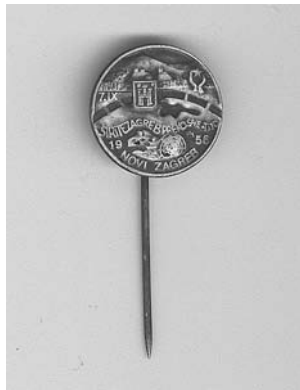
figure 10: Pin with the sign 'Building Zagreb across Sava'

The identity systems of every specific time are materialized in urban forms, and in their continuance their meanings are always newly interpreted. The communist period cultivated a relatively negative relation towards the urban and architectural shapes that preceded it, which was manifested towards the space of the Lower Town, whereas the Upper Town remained outside the ideological discourse despite the fact that churches and state institutions are located there. However, systems are created as continuities, which is why some periods simply cannot be left out but, based on their identifications, those symbolic constructs that least differ from the desired ones should be selected. This method enables maximum participation in building new identity systems, the aim of which is to create urban icons. The development of Vukovar Street, the Zagreb Fairground, or New Zagreb was in a continuous dialogue with the city on the left bank of Sava. Even in form, the views towards the old city center were not closed off, but there was an attempt to produce a positive dialogue and mutual affirmation in the identification of contemporary Zagreb.