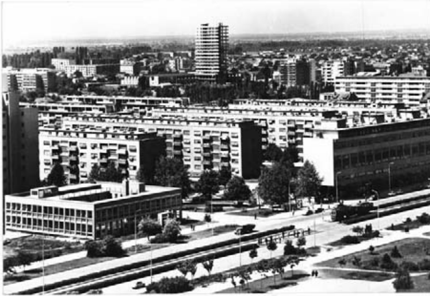
figure 2: Postcard with Vukovar Street – view at southwestern part of the street with residential building by Neven Segvic built in 1947-49 (right) and Vjesnik Skyscraper during construction in the background (Antun Ulrich, 1972)

named Beogradski bulevard ‘Belgrade Boulevard’ in 1948, then renamed Ulica proletarskih brigada ‘Street of the Proletarian Brigades’ in 1954, and finally renamed Ulica grada Vukovara ‘Vukovar Street’). This genealogy of the street’s name suggests its symbolic value and reflects the complex social scene of this east-west artery.