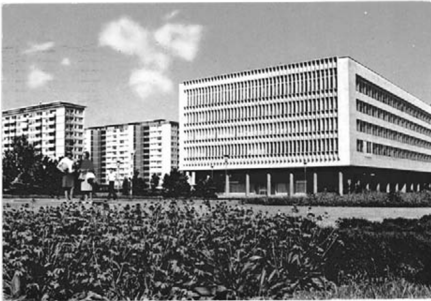
figure 3: Postcard with Vukovar Street - left: residential building by Drago Galić, 1956-59, right: City Hall by Kazimir Ostrogović, 1955-57

only the construction of housing, but the construction of a homeland, as well as direct participation. This was demonstrated on postcards with the motifs of workers' campaigns, in which men and women stood side by side, under the slogan of brotherhood and unity, participating in this sacred process. The uses of advertising established a completely new set of ideological and social values, a new architectural urban system, and a new iconography represented by workers and the products of their labor.