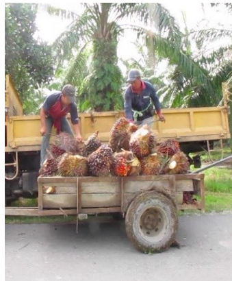
Figure 3 Workers posture during unloading FFB activities from mini truck into the lorry