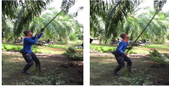
Figure 1 General postures during FFB harvesting activities