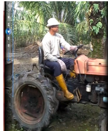
Figure 4 The truck driver's posture