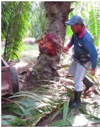
Figure 2 Workers posture performing FFB collecting activities