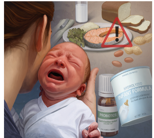
ILLUSTRATION BY TODD BUCK

CME This clinical content conforms to AAFP criteria for continuing medical education (CME). See CME Quiz Questions on page 565.