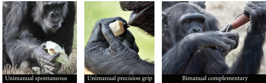
FIGURE 1: Different tasks performed by some of the chimpanzees at Fundació Mona (Girona, Spain): unimanual spontaneous task, unimanual with precision grip (simple reaching), and bimanual complementary task (hose task) with tool use.

unimanual actions, and bimanual complementary tasks are the least common. These authors also concluded that bimanual actions seem to be more indicative of hand laterality than unimanual actions.